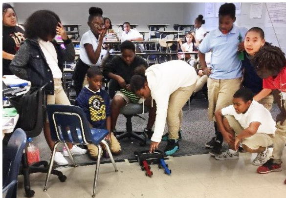
North Clayton Middle School Scholars preparing to race their dragsters.