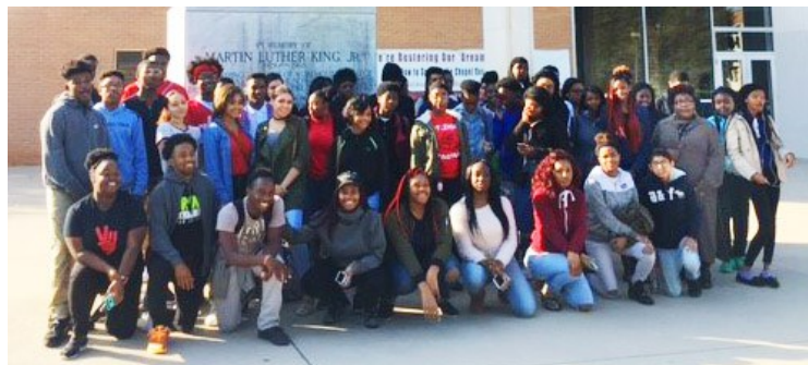
Mount Zion High School students pose in front Dr. Martin Luther King Jr. International Chapel on Morehouse College Campus.